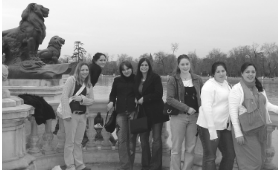
Cottey students in Retiro Park, Madrid, Spain, as part of the International Experience.