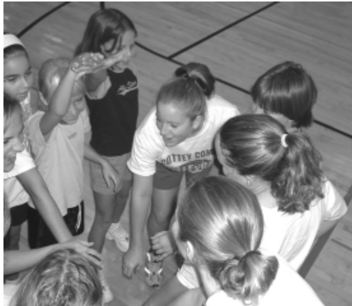
Cottey students have many opportunities to volunteer in the community.