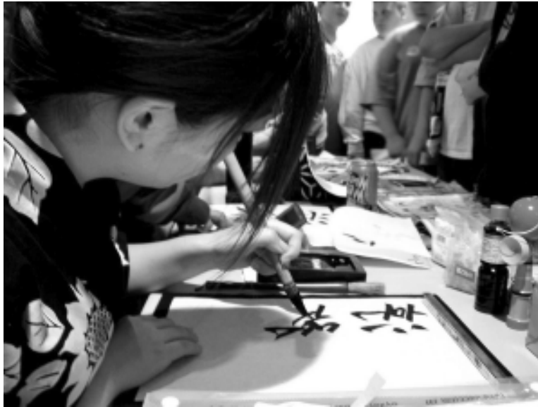
Students in sociology classes organize and run the annual Cultural Fair.

Cottey College is authorized under federal law to enroll nonimmigrant students. The registrar also serves as international student coordinator and in this capacity assists international students with matters relating to U.S. Citizenship and Immigration Service policies and procedures.