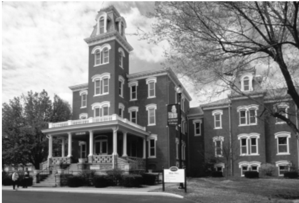
Cottey College's Historic Main Hall

As I considered this change in my career, I was most impressed by the women I met at Cottey College. I recognize this as an environment in which I will continue to learn and grow as I contribute to the learning and growth of others. This is the synergy of Cottey College. I invite you to be a part of this dynamic campus.