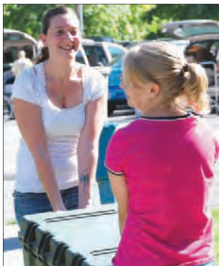
It helps to have a strong back—and a friend—when it's time to move into your residence hall.

Almost perfect weather greeted the students and families as they began unloading cars full of boxes, bags, and crates. Missouri weather—notoriously hot and humid in late August—was unseasonably mild and dry. Although students, parents, and orientation leaders were tired by the end of the day from moving belongings into the halls, no one was drained from the heat.