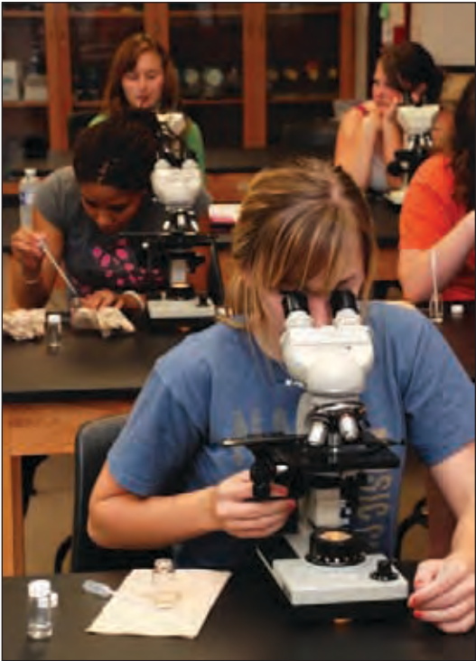
A summer science participant adjusts her microscope during a biology class.

This next summer, the camps are scheduled for June 13-19. More information is available on the Summer Programs page on the Cottey Web site. Applications will be available in January.