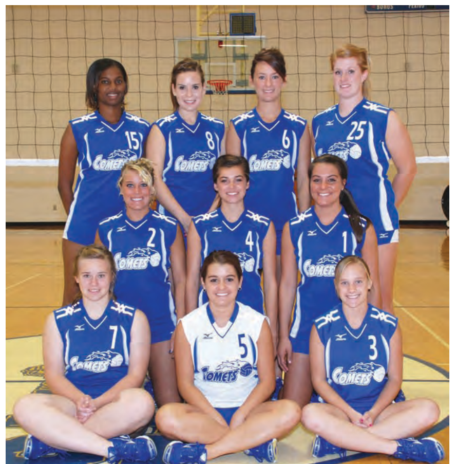
The 2009 Volleyball Comets

Visit the Volleyball page on the Cottey Web site to keep up with the young team's progress. The schedule for the rest of the season is on page 10. Find a game near you and come cheer for the Comets!