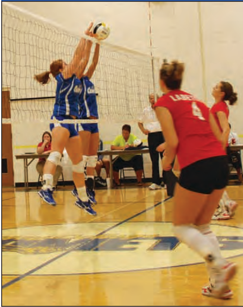
Two Comets get a block against Labette County Community College in the first home match of the year.

The Cottey Comets volleyball team is having a bit of a rough start to the season. As of the Viewpoint deadline, they were 0-6 on the year. Although the win column is empty, this team is tenacious and intends to continue improving every match.