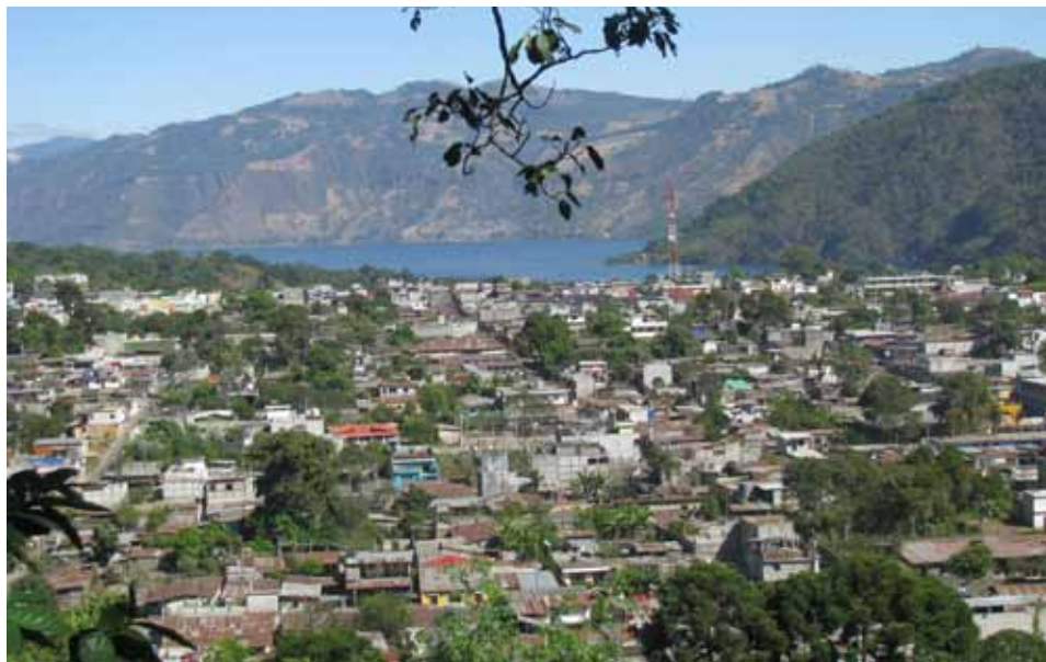
A view of San Lucas Toliman, Guatemala. Lake Atitlan is in the background.