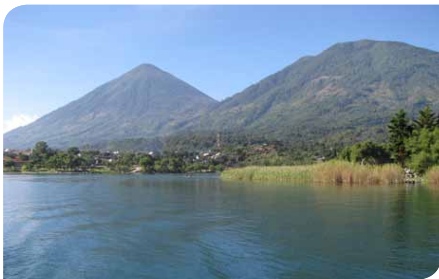
A look back at San Lucas from beautiful Lake Atitlan.

"Cottey College has given me the opportunity to pursue a higher education to learn more. And now I can go back to my community and apply it there, so it's a huge opportunity and I cannot—I don't even have the words to describe how I feel now," she said. "It's a blessing for me; it's just something, I cannot explain it. Because without this scholarship from Cottey College and without this scholarship from IPS [International Peace Scholarship from P.E.O.], and without scholarships from other people, I wouldn't be able to be here now and share my story. I'm just thankful to the College and to everybody for supporting me through my education. And everything that they are doing for me, I'm praying that in my heart when I go back home, I will do it for my people."