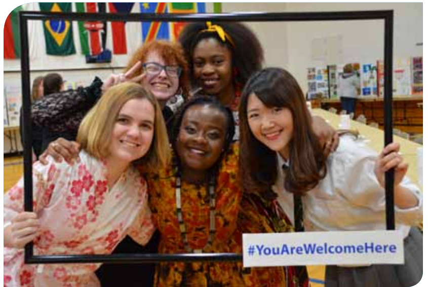
Students at Cottery's 8th Annual Multicultural Festival let international students know they are welcome at Cottery College.

The campaign, launched at an all-campus meeting, uses marketing and social media featuring the message #YouAreWelcomeHere. The Marketing and Strategic Communication Department, in cooperation with Enrollment Management, Academic Affairs and Student Life, developed a communication plan that was submitted to the #YouAreWelcomeHereusa.org for acceptance into the campaign.