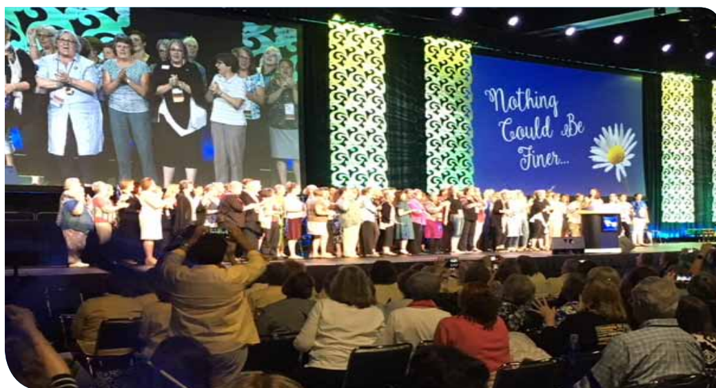
Cottey alumnae gather on stage to serenade the delegates at Convention..