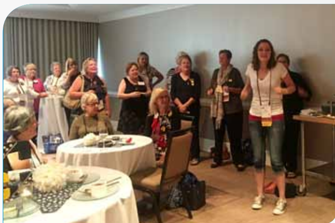
Alumnae gather at a reception at Convention of International Chapter in Charlotte.