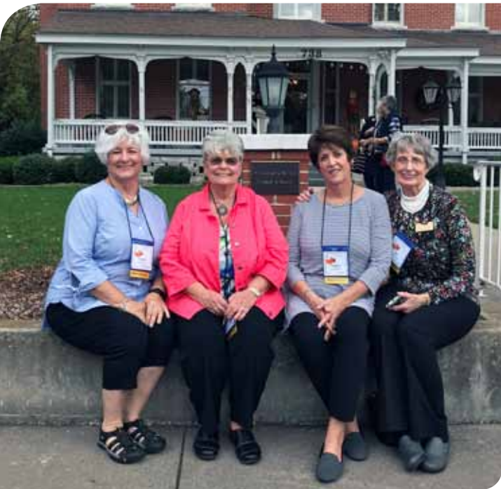
A group from Lee's Summit, Missouri, posing in front of the President's House after the P.E.O. Visit Day reception.

After the conclusion of the scheduled events, some guests lingered and enjoyed visiting with their Cottey students. We were so glad to see each guest and hope many will come visit us for future events on campus. Help spread the word about our upcoming campus events!