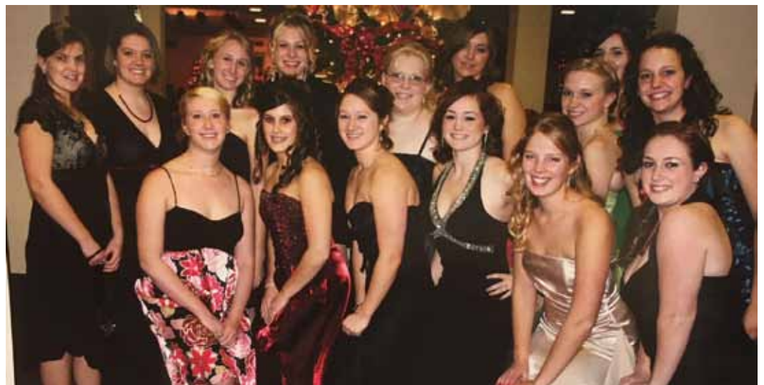
These Rosemary residents from 2008-2009 were the last to see any new furnishings in the suite. The Class of 1998 was the last class to see any new bedroom furnishings.

As of press time, a total of approximately $9,100 has been given. This year at Founder's YOU can Run for Rosemary! Fifty percent of the proceeds from the Imagine, Believe, Achieve 5K Walk/Run/Cheer entry fees will go towards Mission Refurb Rosemary (the other 50% is going to the Nevada Food Pantry).