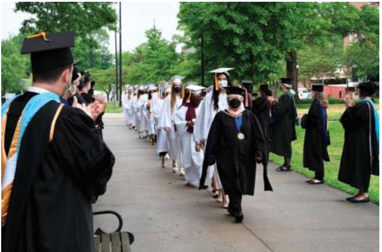
Faculty applaud the associate degree graduates as they process into Hinkhouse.

students processed through the lines and into the gym, faculty members applauded the graduates to express their pride. Even though participants were wearing masks, it was easy to see that many students were moved by the presence of and applause by the faculty.