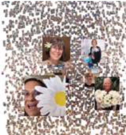
The Daisy Montage