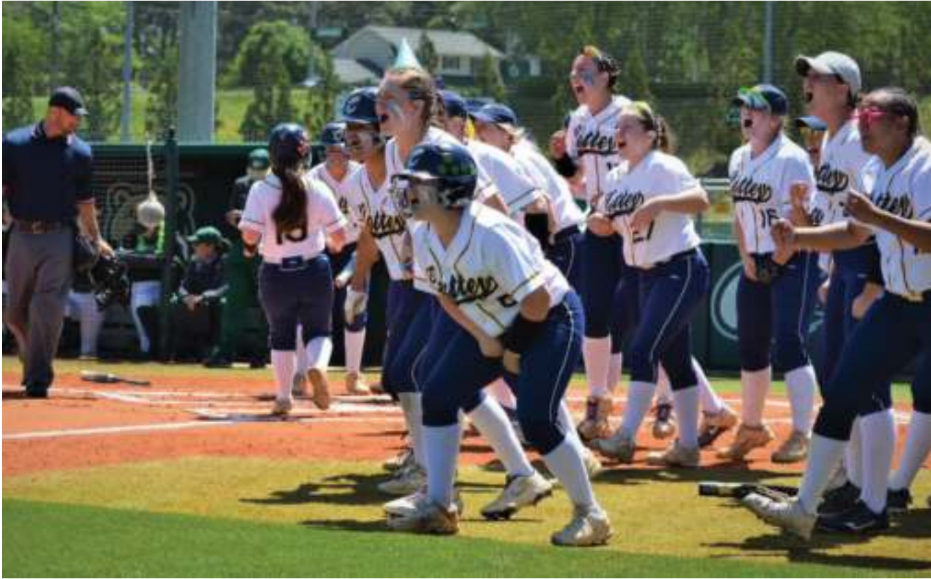
The softball Comets cheer as they score again in an upset win over the nationally-ranked Georgia Gwinnett team during the A.I.I. Conference playoffs.

round. The Comets faced Oregon Tech and lost 4-0 which dropped them into the lower bracket. Their season ended the next day with a 5-1 loss at the hands of Coastal Georgia. The Comets finished the season with a final record of 26-8.