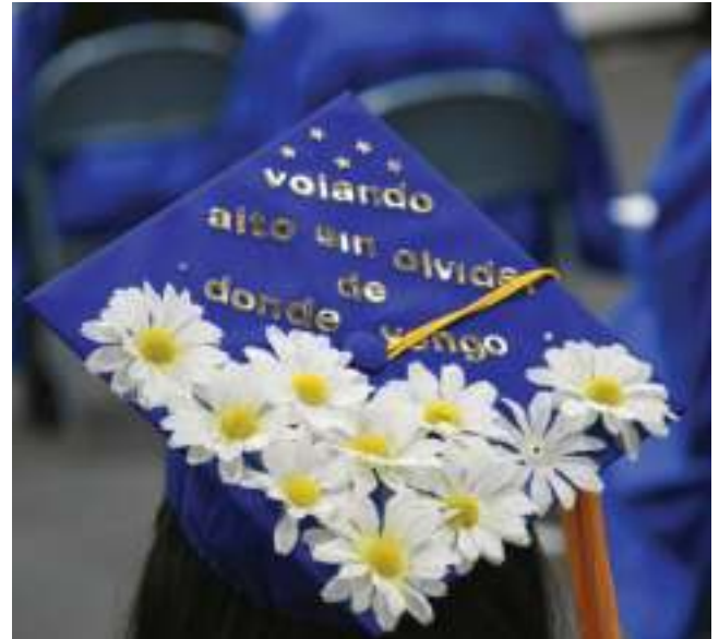
This mortarboard reads “Flying high, but remembering where I came from.”

Many of the familiar elements of past commencement weekends were still in place. On Saturday evening, graduates still stood on the steps of Main Hall and had their mortarboards placed on their heads by people who were important to their journeys. On Sunday, graduates still dressed in their caps and gowns and carried daisies as they processed to Hinkhouse Gymnasium. Faculty processed to the promenade in front of Hinkhouse and formed two lines on either side of the walk. As