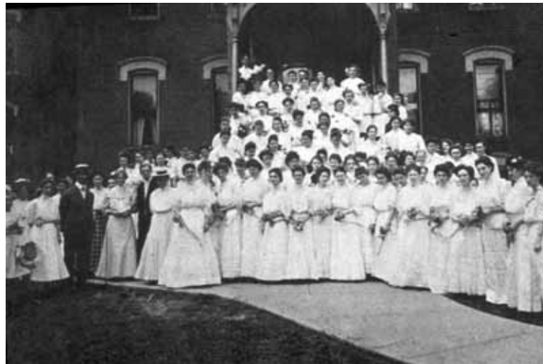
White Dresses and Daisies

Have a special historical note to share? Send it to the Viewpoint ! We’d love to share some of the best of your Cottey memories during this special anniversary year.