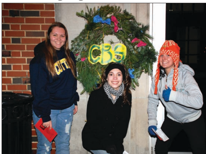
One of Cottey's most beloved traditions, Hanging of the Greens took place on December 4. Here, members of Cottey Big Sisters pose with their wreath.