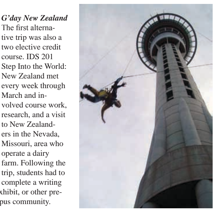
Chelsea Jones base jumps off of the tallest building in the southern hemisphere.

Despite that, the trip was so successful and popular that approximately 20 students expressed interest in the New Zealand trip for 2010. Additional alternative trips may be planned in the near future as well to address the interests of students and faculty members.