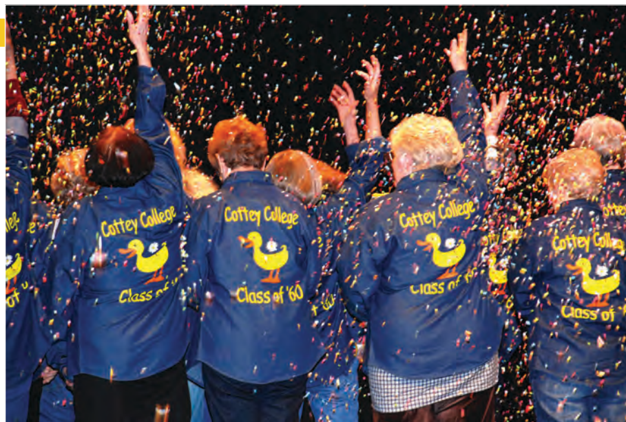
The Class of 1960 gets into the spirit at the Homecoming Celebration.

ditional serenade by current Cottey students dressed in class attire (DJs and Baby Blues)! They were not disappointed. The serenaders led rousing choruses of familiar songs and some that were