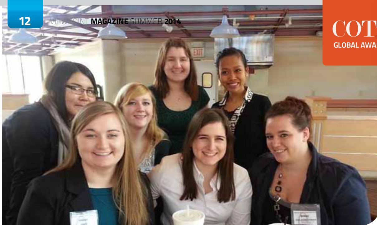
Some of the Cottey students who participated in Model UN this spring.