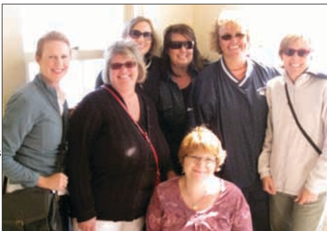
The fourth Minnesota Suite reunion – look at us 20+ years later!!