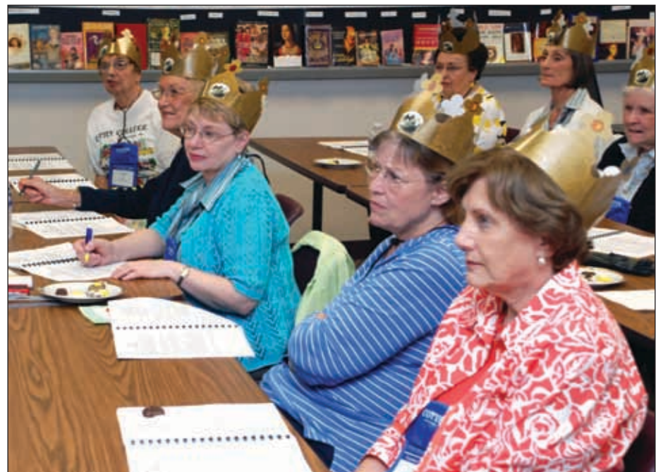
You'll be treated like royalty at Vacation College! This year's dates are May 18-23, 2010. Applications will be online in early January.