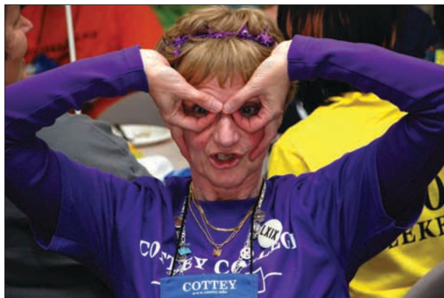
You don't have to be a junior birdman (or even know the words to the song) to reconnect with classmates and other Cottey friends at Founder's Day Weekend.

Although the schedule has changed, the fun and the spirit of Founder's Day Weekend have not. Mark your calendars for March 26-28 for a great weekend. An online registration form will be available after the first of January. Log onto the Cottey Community after January 1 for full instructions.