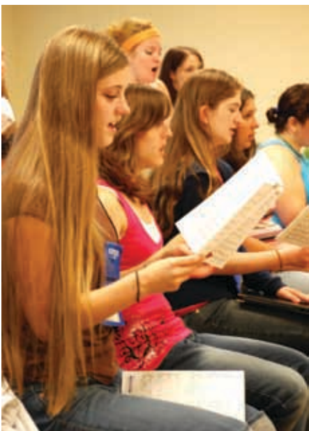
Summer Programs for girls are scheduled for June 13-19, 2010.

Additional information on all programs will be available on www.cottey.edu in the summer programs page beginning mid-January.