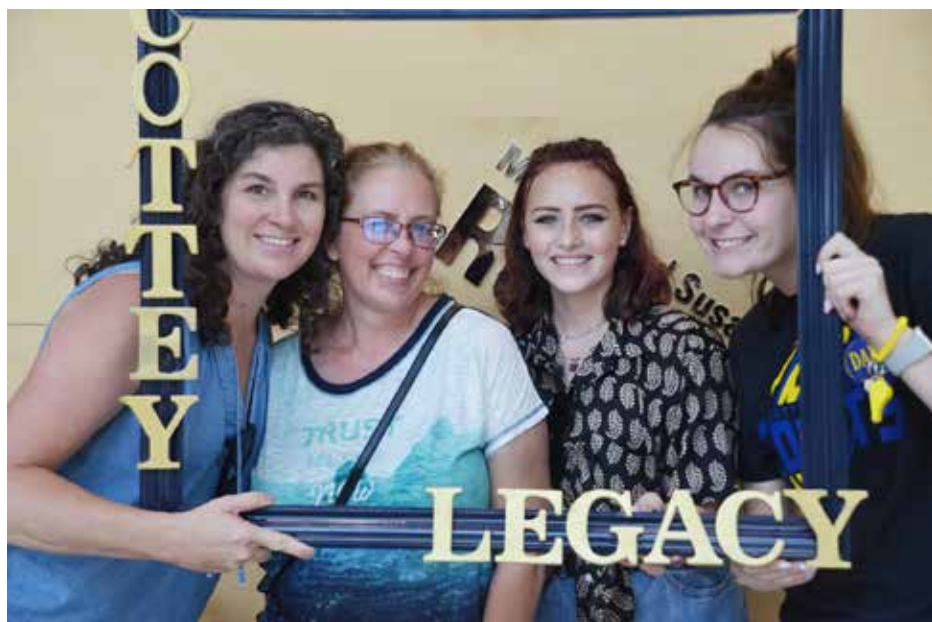
Sharing Cottey with the next generation

Once you've submitted your referral, we will reach out to her with letters, and emails, and by phone. As someone who knows the value of a women's education, we encourage you to stay in touch with her as she goes through this process. Be that someone in her life who believes in her, encourages her, and supports her. Help her say yes to an incredible future at Cottey College!