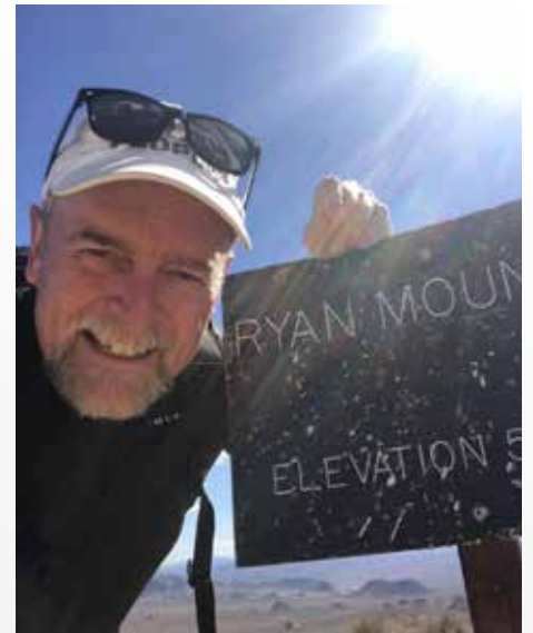
Turning a strong maybe into a successful "Yes" on Ryan Mountain in Joshua Tree National Park.

For some of you, that first risky yes might have been your decision to attend a small, women's college in the Midwest. Maybe (for